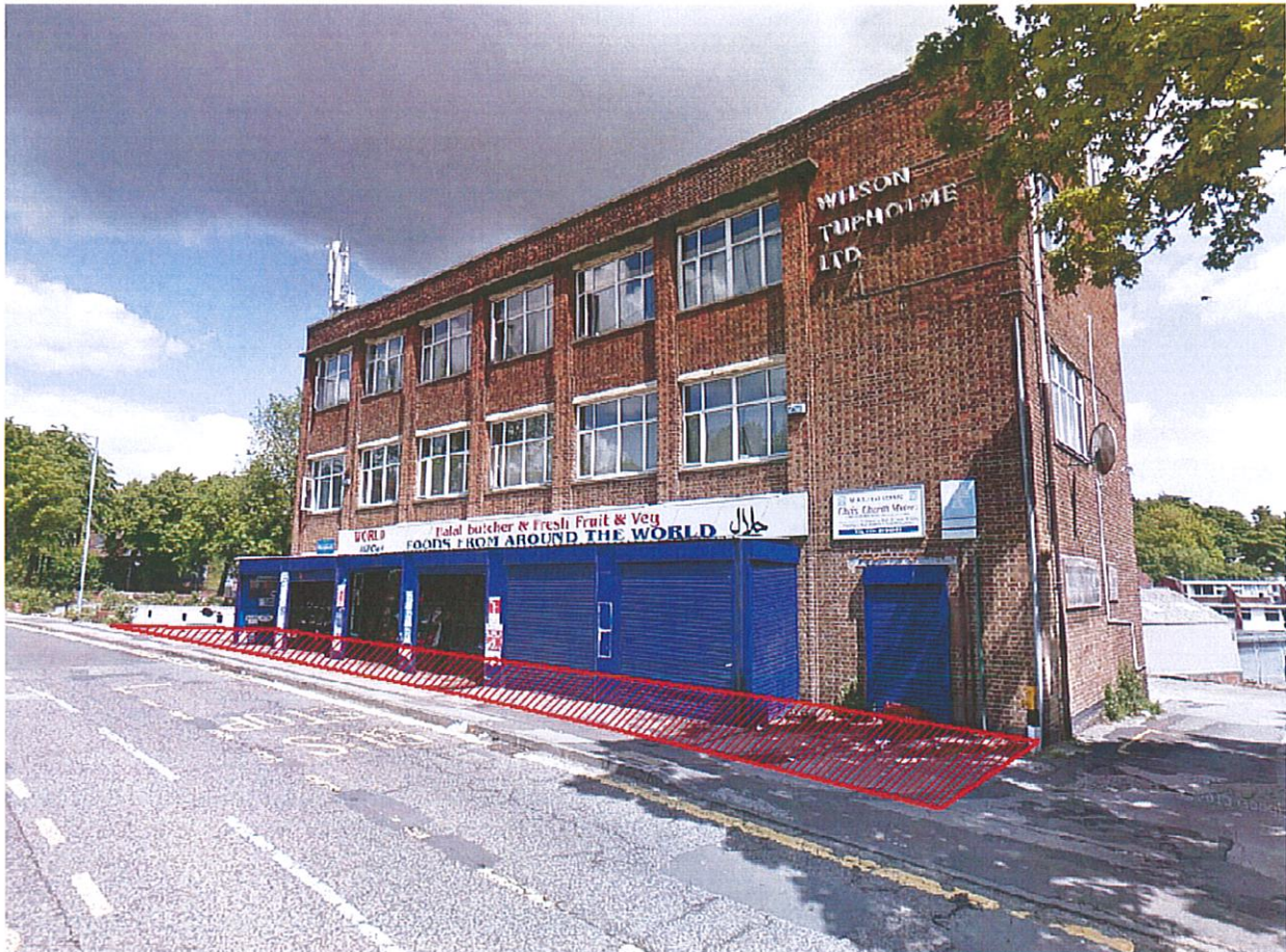
Photo 1 – Red hatching indicates extent of proposed Highway Closure