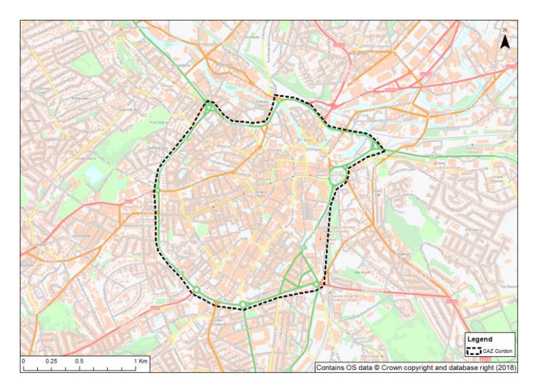
Figure 2 Potential Charging Area 3

These and a range of associated mitigating measures are described in detail in the main Economic Case and in Supporting Document OBC_SD17 (Contents of the Preferred Option).