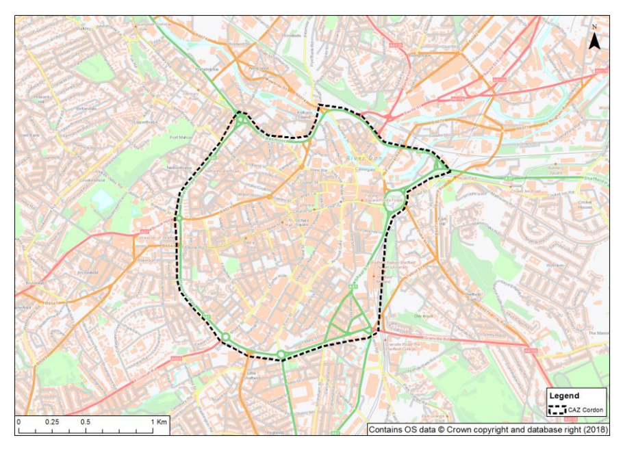
Figure 2 Potential Charging Area 3

Figure 1 Potential Charging Areas 1 and 2