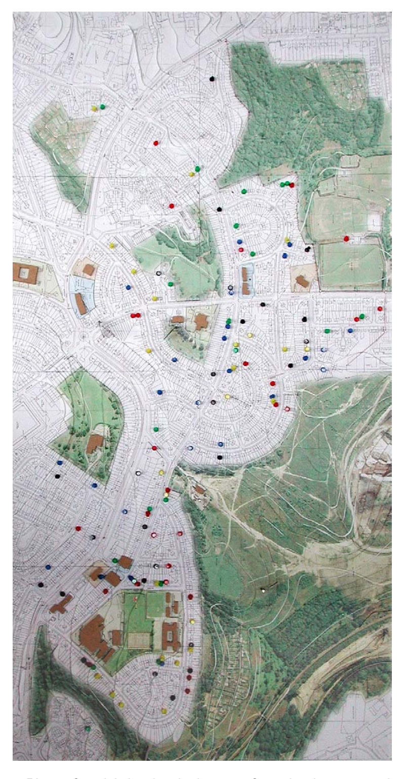
Photo of model showing the houses of people who came to the Big Tent Event