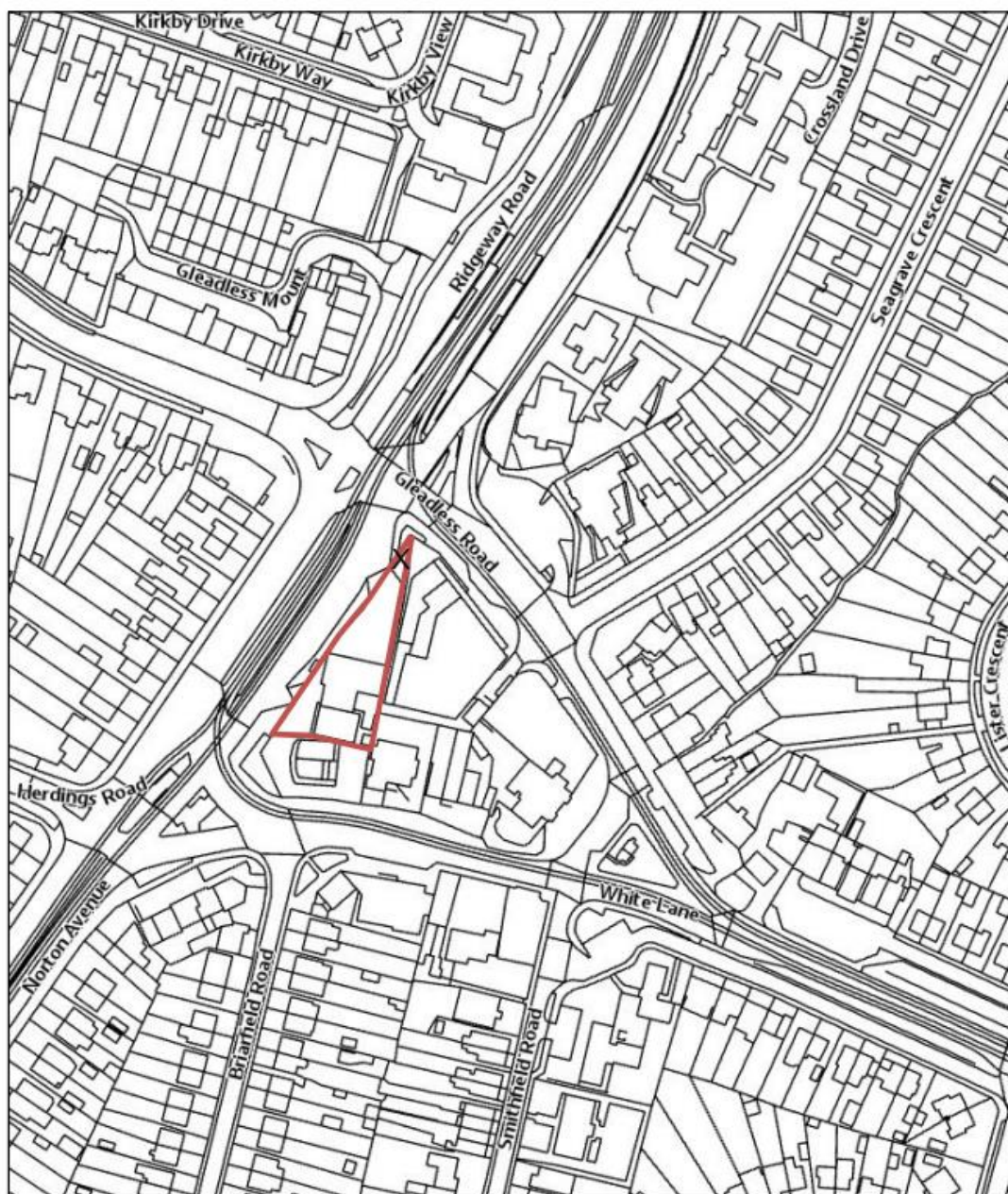
Gleadless Service Station