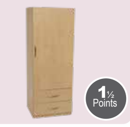
Single wardrobe with 2 drawers (beech)