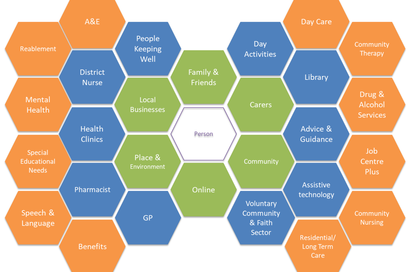
Figure 1: a representation of the type of support that can exist around the person the closer to the person, the more supportive, long term and influential they are likely to be. It should not be seen as complete.

The coronavirus (COVID-19) pandemic has highlighted how important and fragile the adult social care system can be. As active members of the adult social care community, we need to be its advocates. This includes understanding the wider impacts on adult social care and shaping and influencing them wherever possible. It doesn't mean doing everything ourselves: it means working together with our wider communities to make the right things happen in the right way.