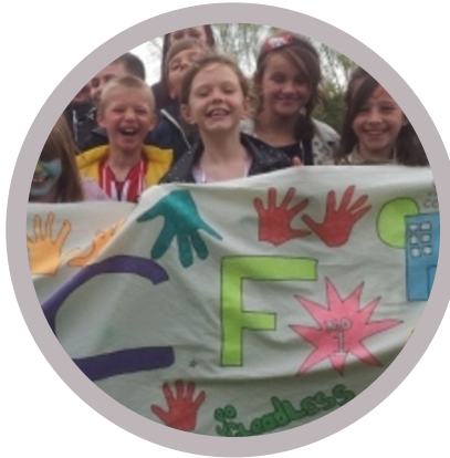
SERVICES AND FACILITIES