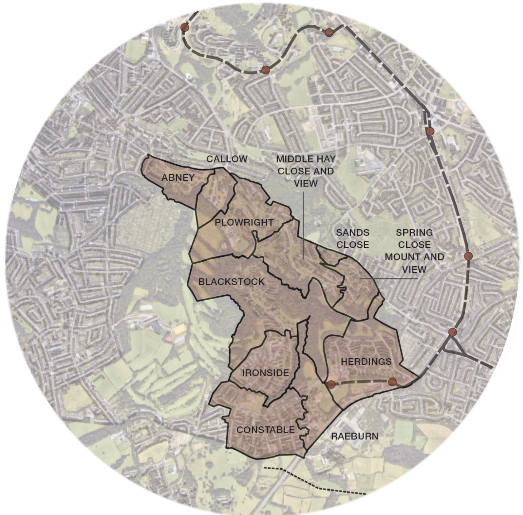
A neighbourhood map from the Baseline Report, 2018

It should be noted that 4 years have passed since the project commenced, and it is recognised that the original baseline facts and figures have now changed. Future designers and consultants should conduct up to date baseline /contextual research to influence their decision-making process.