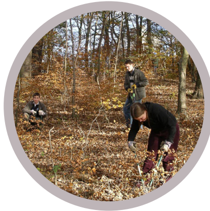
EMPLOYMENT AND SKILLS