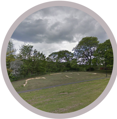
SHARED AND GREEN SPACES