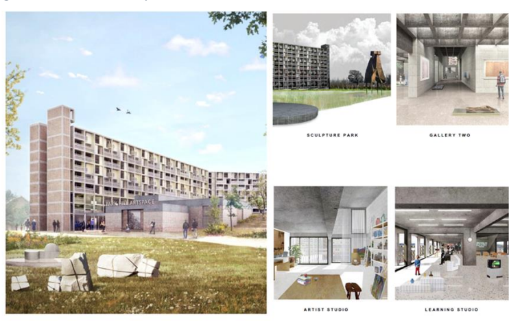
Figure 2: Park Hill Art Space

Harmony Works is a partnership that brings together two esteemed music institutions: Sheffield Music Academy and Sheffield Music Hub. The Hub introduces young people to music through community outreach; the Academy identifies and develops the most promising young talent, and provides a pathway to employment. Both operate out of 'borrowed' facilities in peripheral locations that are not suited to the scale and quality of their work.