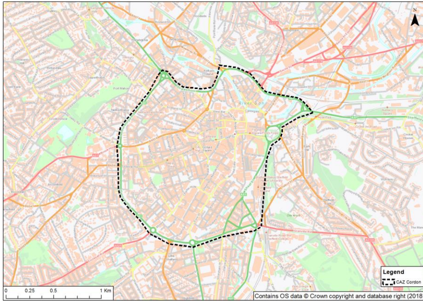
Figure 2 Potential Charging Area 3