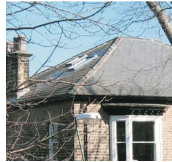
(d) Hipped roofs.