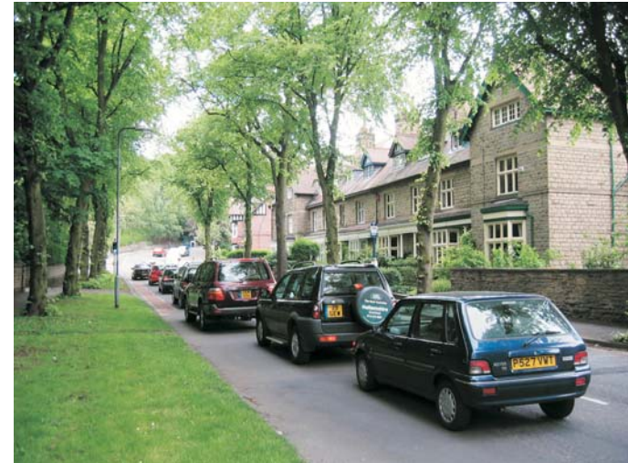
Fig.7 Psalter Lane is an important route through the area, especially at rush hour.

5.1 The escarpment of Brincliffe Edge/Psalter Lane marks a clear and distinctive boundary to the area. Psalter Lane, as the main route through the area and because of its straightness (which affords a vista along its length), reinforces the legibility