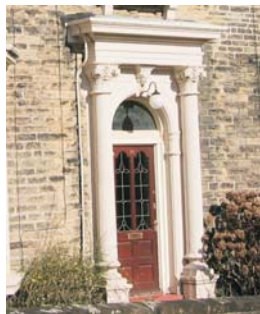
(m) Entrances in elaborately carved wood or stone in classical style.