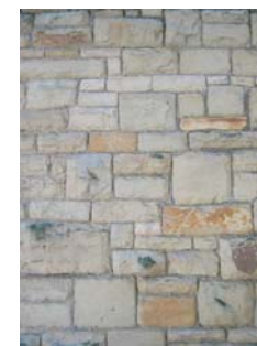
(q) Uncoursed squared rubble - common to side elevations and some inter war houses.