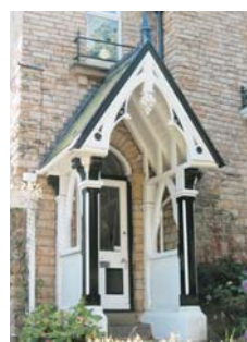
(n) Decorative timber porches, common in high Victorian Tudor Gothic architecture