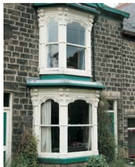
(h) Bay windows, both single and double height.