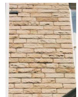
(r) Coursed stone typical to main elevations often in diminishing courses.