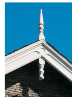
(p) Finials to the apex of roofs.