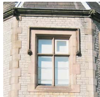
(j) Carved stone, including window/door surrounds, mullion, quoins and hood moulds.