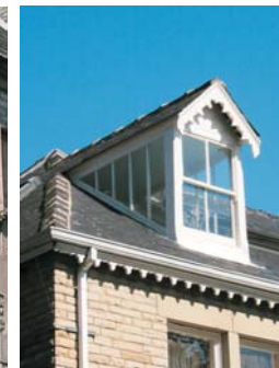
(k) Dormers are characteristic of some Victorian properties. Note the glazed cheeks.