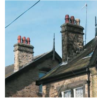
(e) Chimneys with pots.