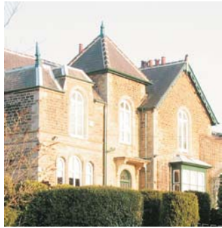
(a) Varied roofing and architectural forms.