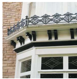
(o) Ironwork as decoration.