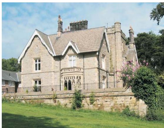
Fig. 12 Brincliffe Towers is a fine crenallated villa which was once the hub of local Victorian society. Its former grounds now comprise Chelsea Park.

7.5 Many villas remain in good original condition, with the retention of typical joinery features and decoration. Elaborately carved barge boards, doors, windows, frames and mouldings are of painted timber construction, with the common use of two and four pane vertical sliding sash windows (with horns) on earlier houses. Some later Edwardian houses, such as the semi-detached houses on Psalter Lane have original casement windows, occasionally incorporating leaded lights and curved glass. Cast iron is also decoratively employed in railing, gateways and other detailing. The quality of local craftsmanship in building construction and techniques is high.