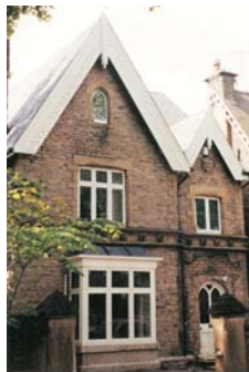
(g) Vertical emphasis & heirarchy of window sizes and forms.