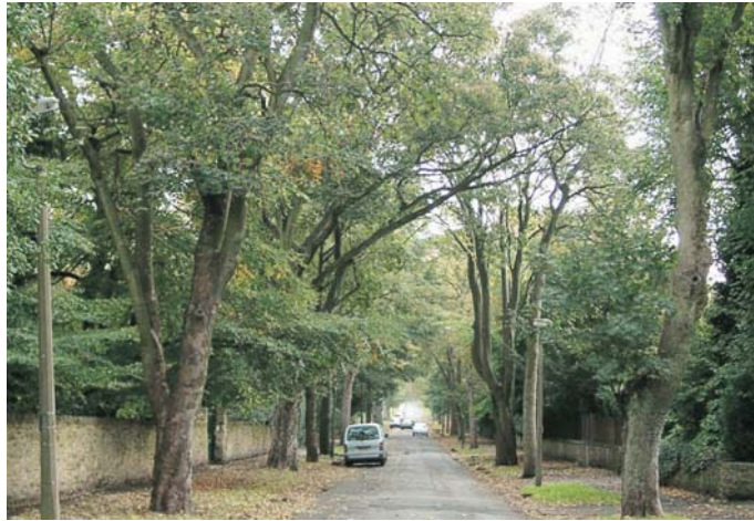
Fig. 13 Lyndhurst Road - one of the finest tree lined streets in Brincliffe laid out in 1868. The trees which frame the vista down the road, were laid out prior to houses being built to create a leafy environment.

8.1 Chelsea Park is the most significant area of greenspace. Formerly part of the grounds of the Brincliffe Towers this attractively sloping area of parkland, with its mature trees, is well used by local people. The parkland itself is largely invisible from the outside, being obscured either by high walls or trees, although the latter do contribute significantly to the visual quality of adjoining areas. Public art within the park is an additional attraction.