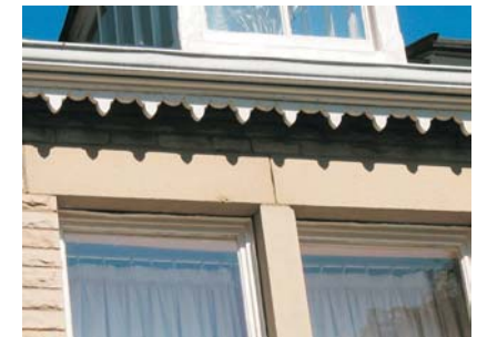
(l) Stone sills and lintels.