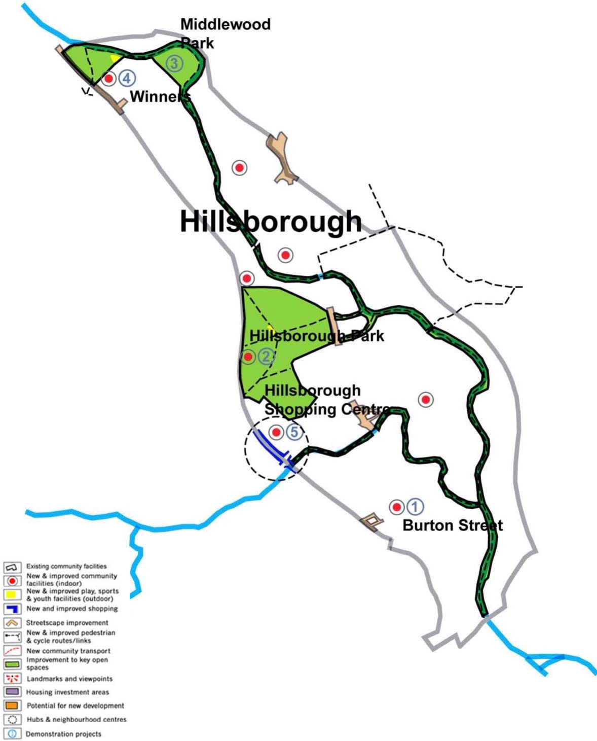
Neighbourhood Strategy Diagram for Hillsborough