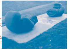
1. Brendan's Glove Garden