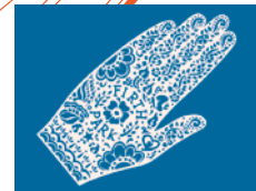
4. The Giants Hands and Feet