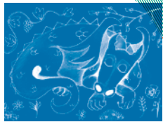
8. The Merlin Dragon Way