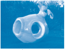
10. The Sun Apple