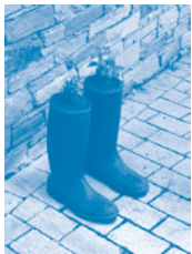
7. The Smelly Wellies