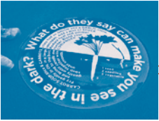
9. The Pavement Plates