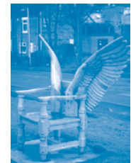
3. The Enchanted Chairs