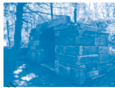
11. The Lost Gateway