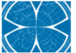
2. The Star-crossed Queen