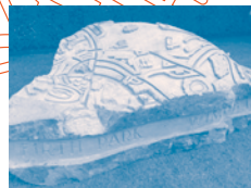
5. The Map Rock