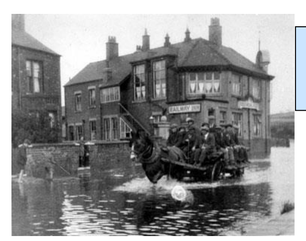
Flooding at Beighton, 1920s

There are many photographs and illustrations about flood events in Sheffield available to see online at <a href="https://www.picturesheffield.com">www.picturesheffield.com</a>. Here are a few examples.