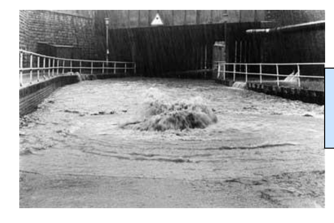
Upwell Street bridge during a flooding event in May 1979