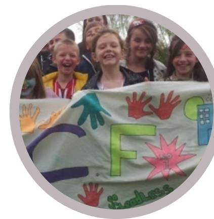
Services and Facilities