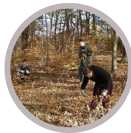
Employment and Skills