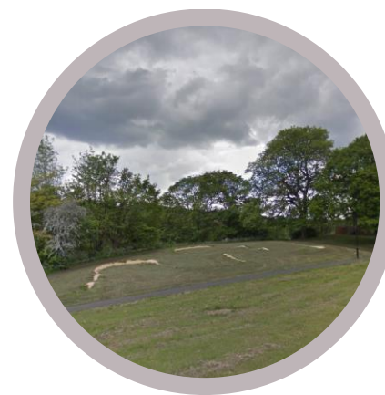
Shared and Green Spaces