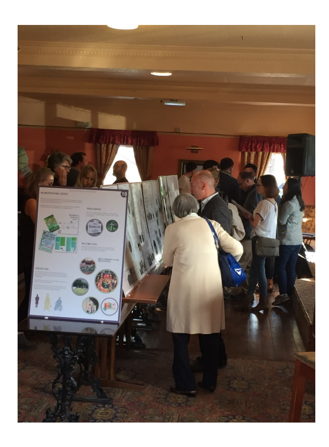
Images from Gleadless Valley Resident Engagement and Consultation Process (2018 – 2022). Further consultation will be held as the Masterplan goes into the Delivery Phase