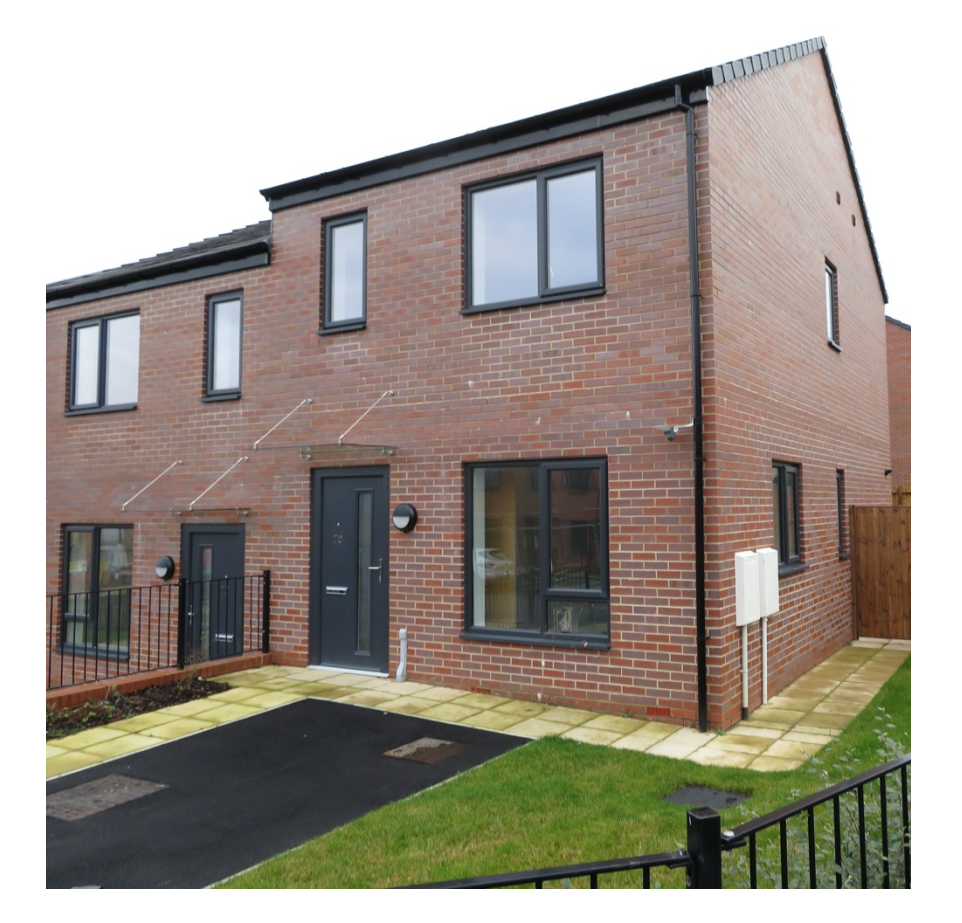
New homes will be built on some cleared sites and small areas of underused green spaces to help ensure that residents in homes that will be replaced or remodelled will have a choice of local homes to move to.