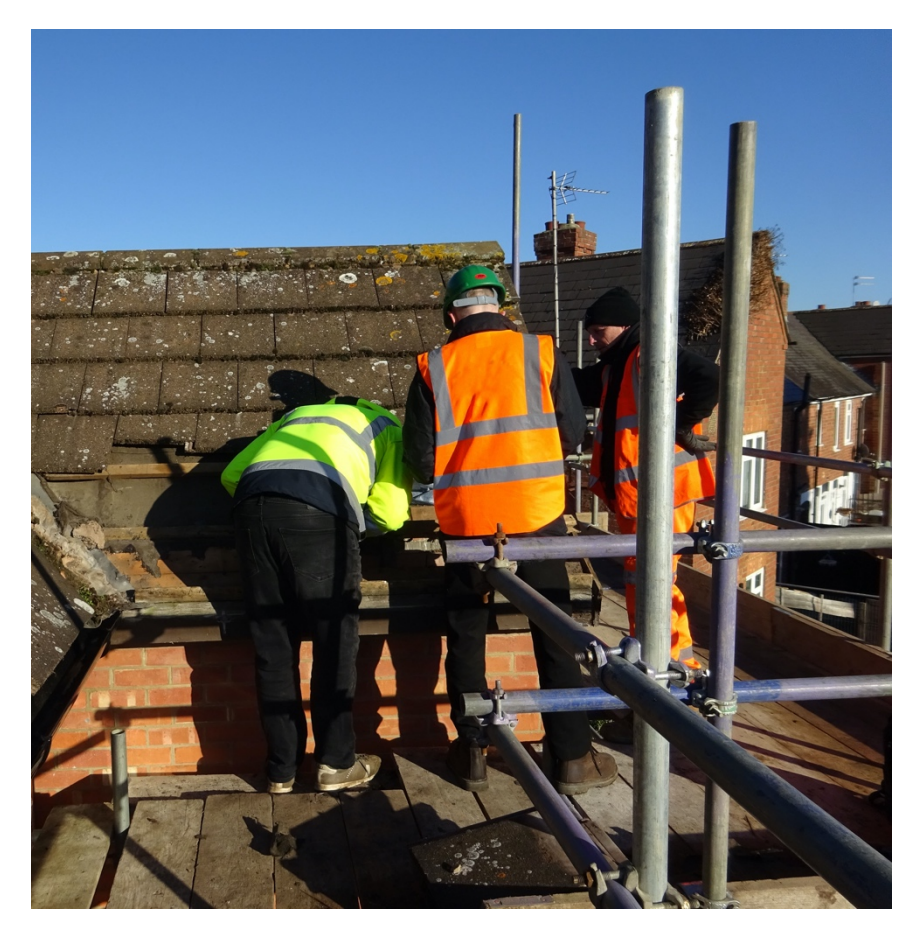
Training and employment opportunities for local people will be a key outcome from public investment as the housing and environmental work is delivered.