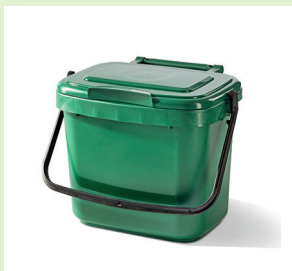
A food caddy to collect the waste in the kitchen

To help you to recycle your food waste easily we will provide you with: