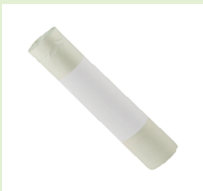
A roll of liners to line the caddy