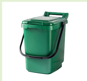
An outside food waste bin which we will empty weekly